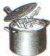
UMM Chicken Stew 11:00 AM