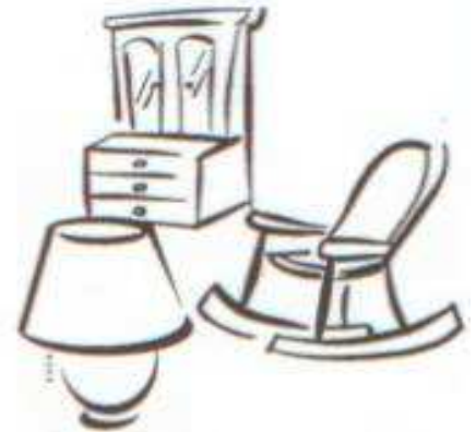
ABC Treasures Finance Committee