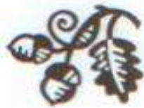
UMW Nut Sale