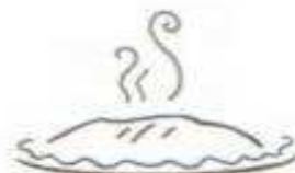
UMW Chicken Pies